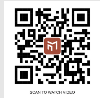
Touch Release Pistons